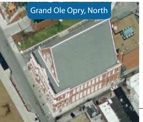
The Ryman Auditorium still shines in downtown Nashville as the original home of the Grand Ole Opry. From a traditional nadir orthophoto, the roof is visible. With the southern oblique view, you can see the steps where greats such as Johnny Cash and Loretta Lynn made their entrances. Wehrli/Geosystems's 3-OC-1 pushbroom style oblique camera and Woolpert's SmartView process have produced a picture that's worth a thousand lyrics.

A separate objective lens is used for each view and each camera has a Kodak tri-linear CCD sensor array providing true color imagery. The sensor arrays have 8,023 pixel elements with a physical pixel size of nine by nine micrometers. The 3-OC captures pixels in a row, one row after another. The key is every pixel is the same size.